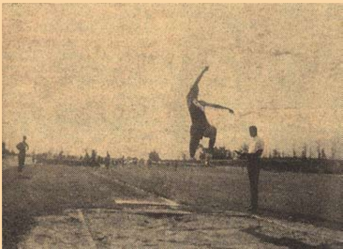
JOHN PITTS jumps to another victory