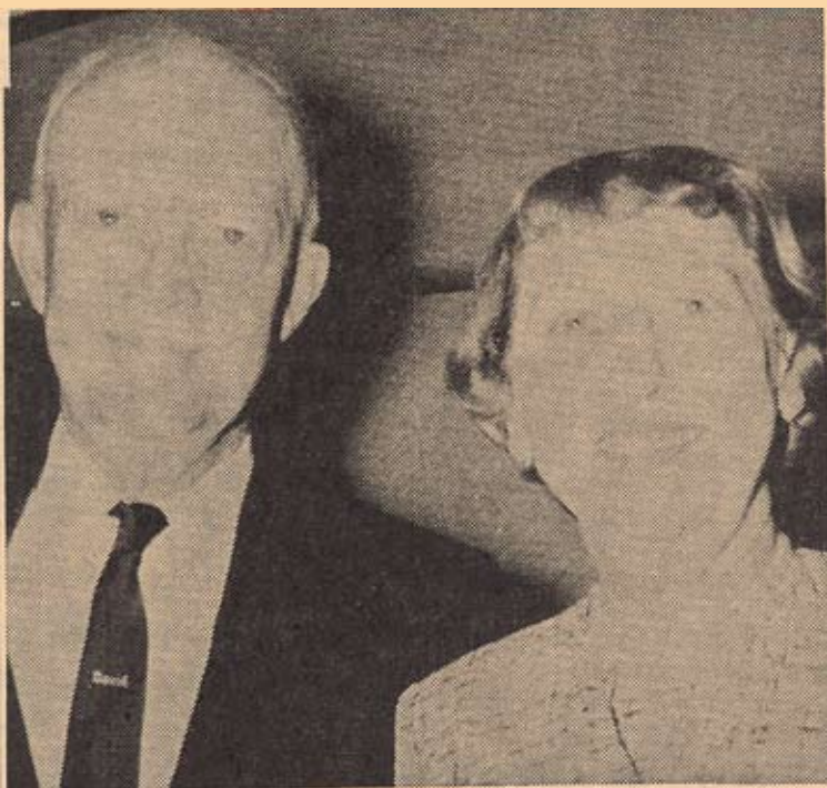
FORMER PRESIDENT Dwight D. Eisenhower and wife, Mamie pause in San Bernardino for a news conference with EHS students.

The date of presentation has not been set.