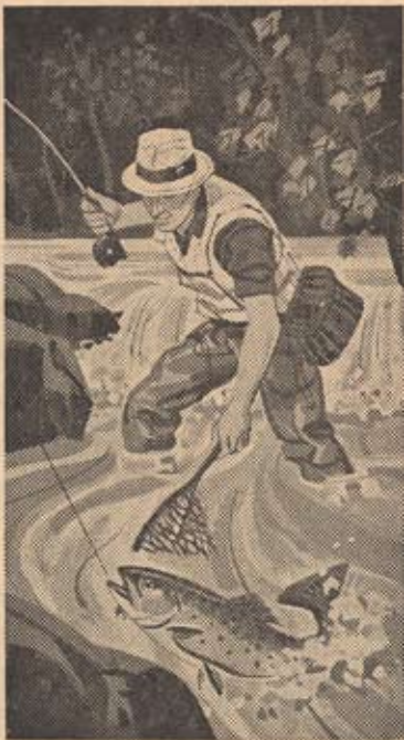
It's Cool in the Mountains!

EASY TO REACH: Imagine all this within a short drive from the San Bernardino Freeway — only 1½ hours from Los Angeles, 20 minutes from San Bernardino, 15 minutes from Fontana and Rialto.