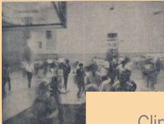
For that fuzzy feeling, try squa jr.'s and sr.'s are doing.