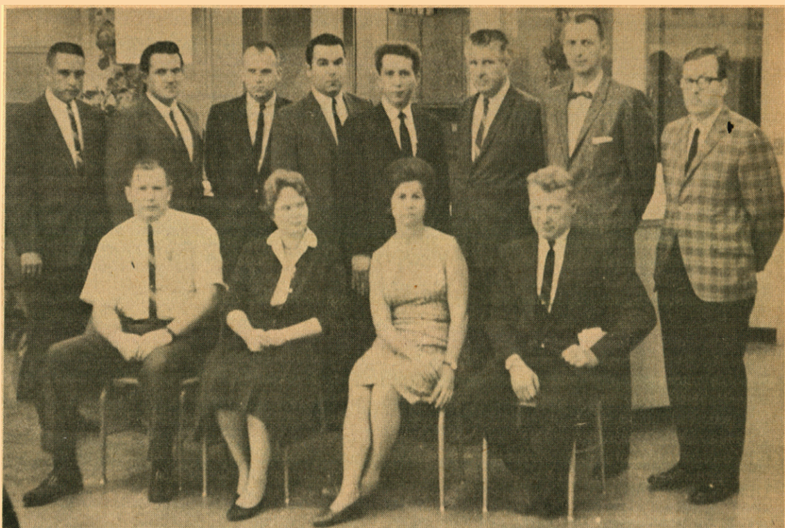
TO BETTER EISENHOWER HIGH SCHOOL this year ten new teachers have been added to our staff.

We welcome all of our other new staff members to a coming "IKE" year! We all hope the students and school year situation please you as long as you all here!