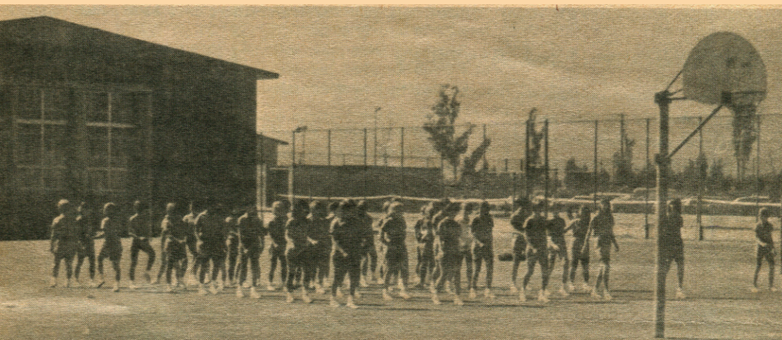
HERE WE HAVE the Eisenhower Drill Team going through their paces. The Drill Team adds something extra at halftimes as they march into well-organized formations.