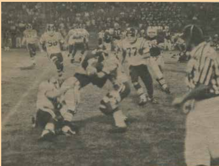
SOMEBODY SHOULD TELL this North defensive man that the Eagles don't obey stop signs.