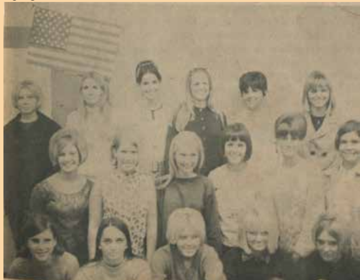
ABOVE ARE THE NEWLY-ELECTED members of the Sen-Tetts at their first meeting of the year.