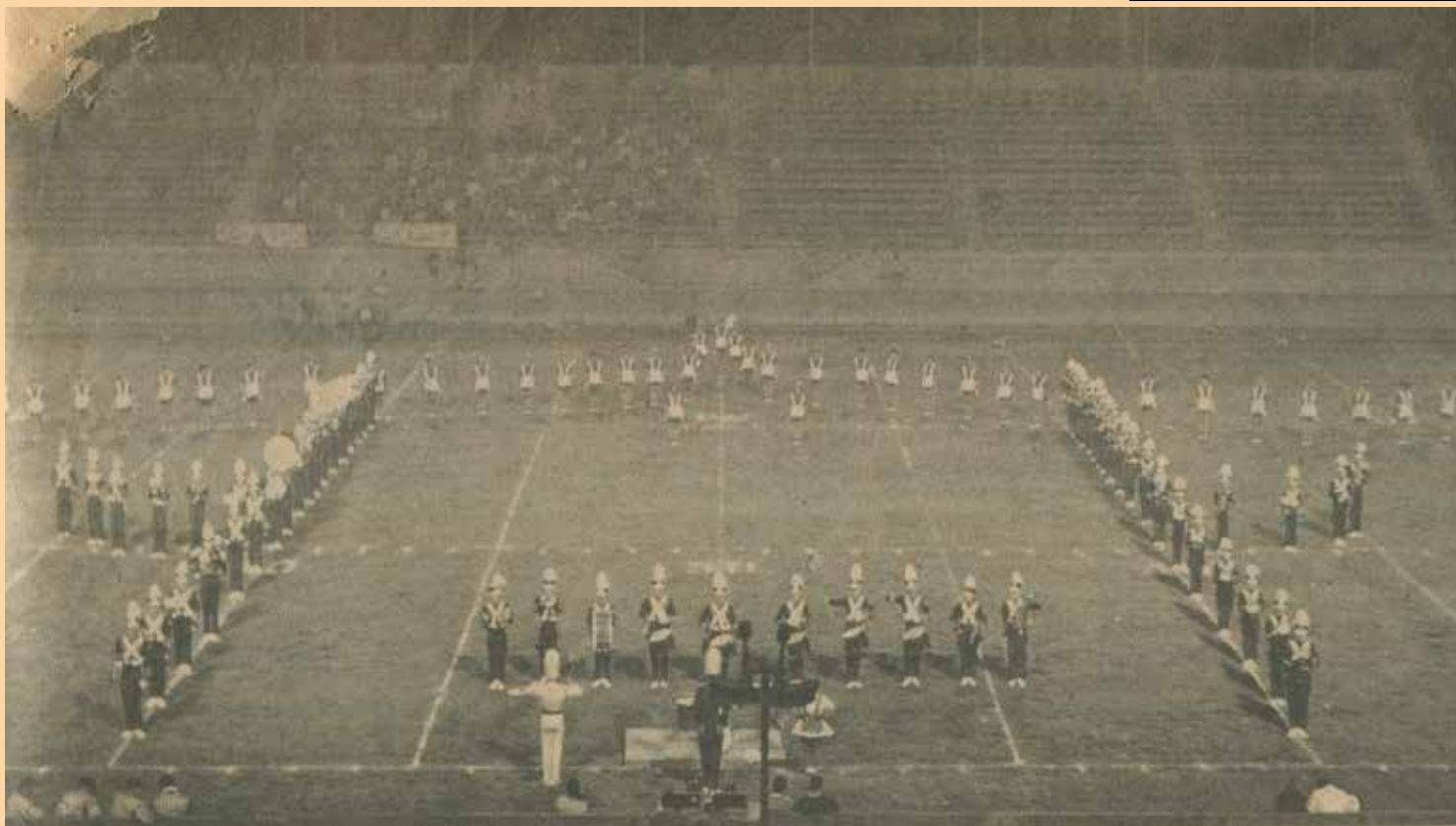
AUDIENCE WATCHES AS IKE'S BAND presents "Spotlight on Percussion" during half-time activities against John North High.