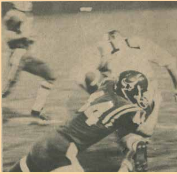
DURING.. Northern Huskie is dropped by a member of Ike's tough defensive unit during the game.